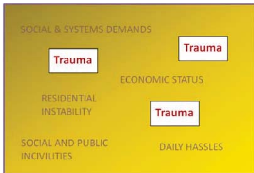
Figure 1: The traumatic context of urban poverty includes increased risks of discrete traumas, such as violence and crime, as well as difficulties that exacerbate trauma's effects.

infestations, difficulty finding a safe way to get children to and from school, and multiple daily hassles due to inadequate access to resources and opportunities. (Figure 1)