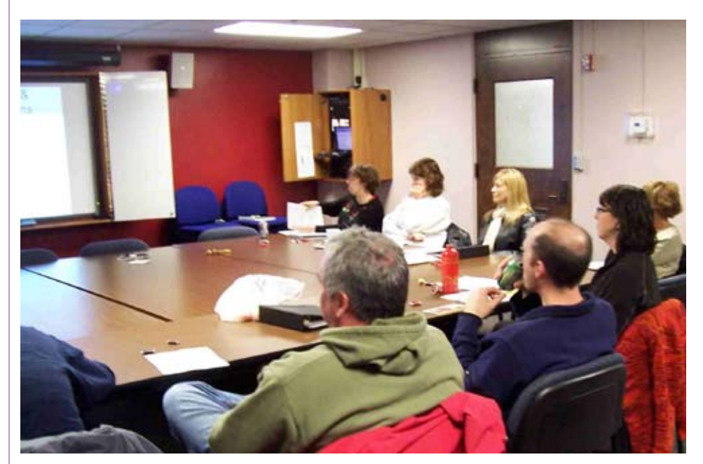
Trauma Informed Parenting training held in December 2009 in Dane County, Wisconsin.

Foster parents, social workers, federal administrators, and child trauma specialists worked together to develop the training program and pilot it in Baltimore, Houston, Madison, New York City, and several cities in Michigan. Following the pilot sessions, resource parents almost unanimously reported that the training enabled them to understand youth in their care and respond more appropriately to a child's acting out.